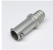
TX10217 - TexConnect™ Adapter

For use with TX7181, TX7182, TX7183, & TX7117 to attach screw-based mop heads.