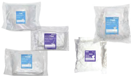
Covers & Head Refills (Non-Sterile & Sterile)