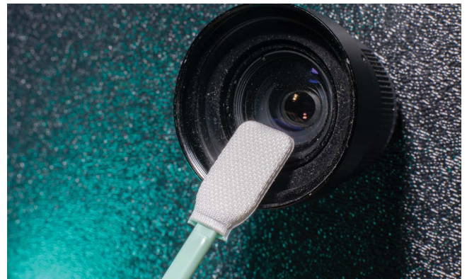
TX714MD Microdenier Large Swab