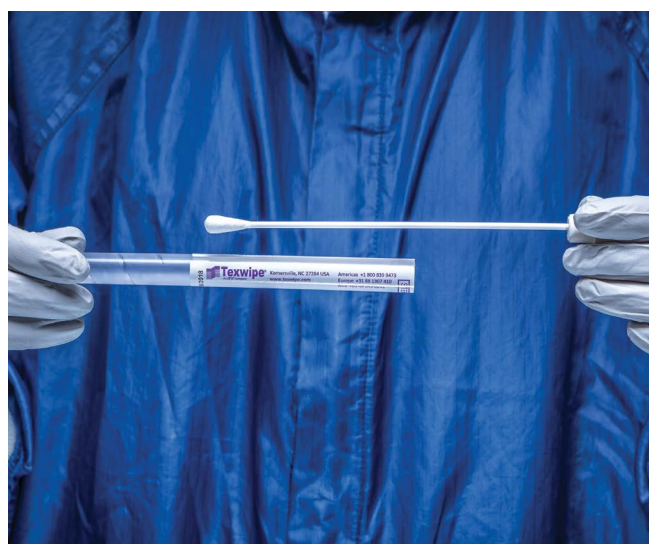
Dry Collection and Transport System swabs are individually packaged in a polypropylene tube